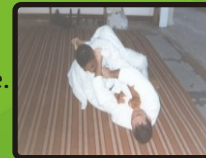
Training in Rickson Gracie's garage.

There's only one academy in Alabama that can say it has the highest ranked Brazilian Jiu-jitsu (BJJ) Black Belt in the state. There's only one academy in Alabama that can say it has more BJJ Black Belts than any academy in the state. We invite you to take advantage of the opportunity to train at that academy. Triad Martial Arts Academy. Come to one class and we believe you'll come back.