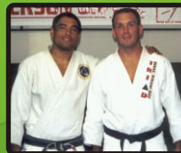
Rickson Gracie at the Triad Academy in Cullman, AL.